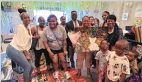
I was lucky enough to visit with First Up: Champions for Early Education & DeeGrace Childcare Center to spend time with early education students & staff. They do such great and important work for brand new learners. Thank you for having me!