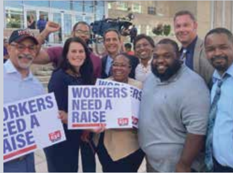
Members of the PA Senate and House Philly Delegations stand in solidarity with Unite Here Local 634.