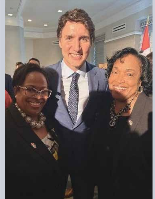
I can't believe my role as a state Rep. led me to meet Prime Minister of Canada Justin Trudeau! It was such an honor to meet the leader of our neighbors up north!